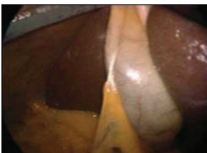
1 Gall Bladder

Printed 2011. Codes subject to change based on quarterly/annual CPT/ICD/CCI changes.