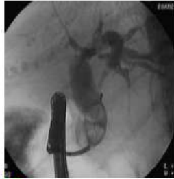
2 Extraction of CBD stones.