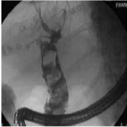
1 Main duct. Multiple biliary stones.