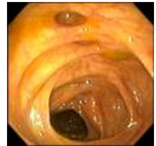
4 Descending Colon/Diverticula