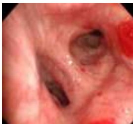
Left mainstem bronchus: Non-obstructing lesion